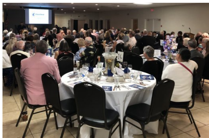
Dining Room at the 2024 Dinner for Life II v2.0