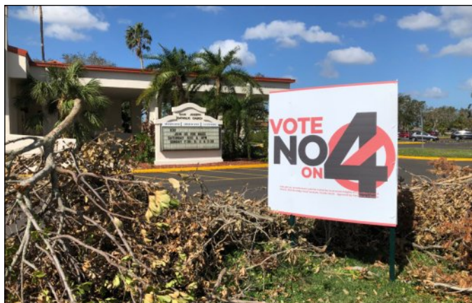
Re-posted sign at St Joe's after Hurricane Milton

Amendment 4 would have never been defeated if it were not for the Florida Council of Catholic Bishops and their steadfast financial support and inspiration and guidance to parishes, clergy and laity all over the state of Florida. Their example and the efforts of Florida Catholics to reach out to brothers and sisters of other religions to take up this cause drove this success. The relationships developed in this process should be built upon in continuing to promote a Respect for Life.