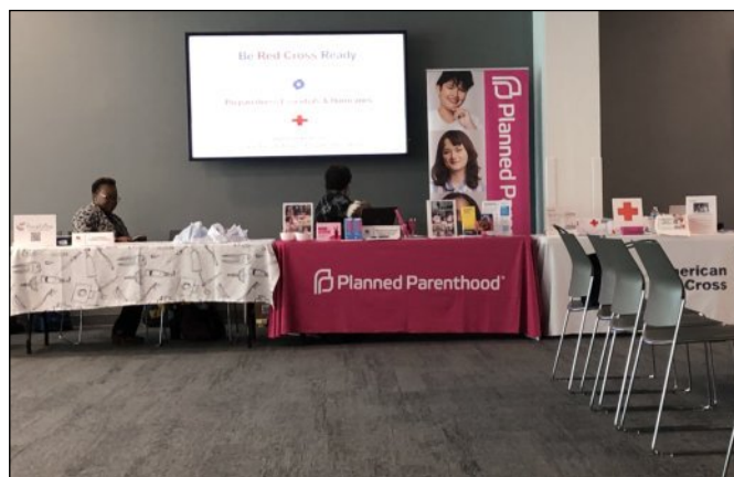
Health Fair at SCF - Planned Parenthood present v2.0